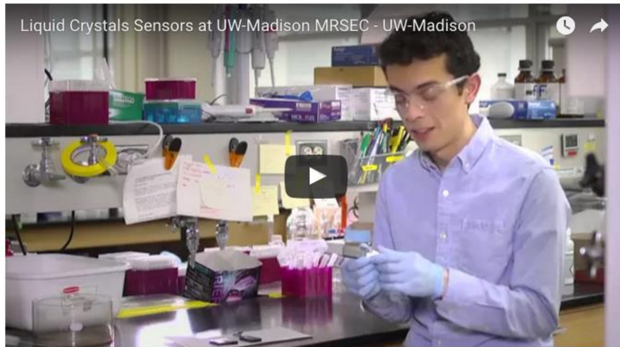
Liquid Crystals Sensors at UW-Madison MRSEC follow us on youtube

The MRSEC Education website is funded by the National Science Foundation. To help maximize its impact, please complete a brief 4-question survey by clicking here .